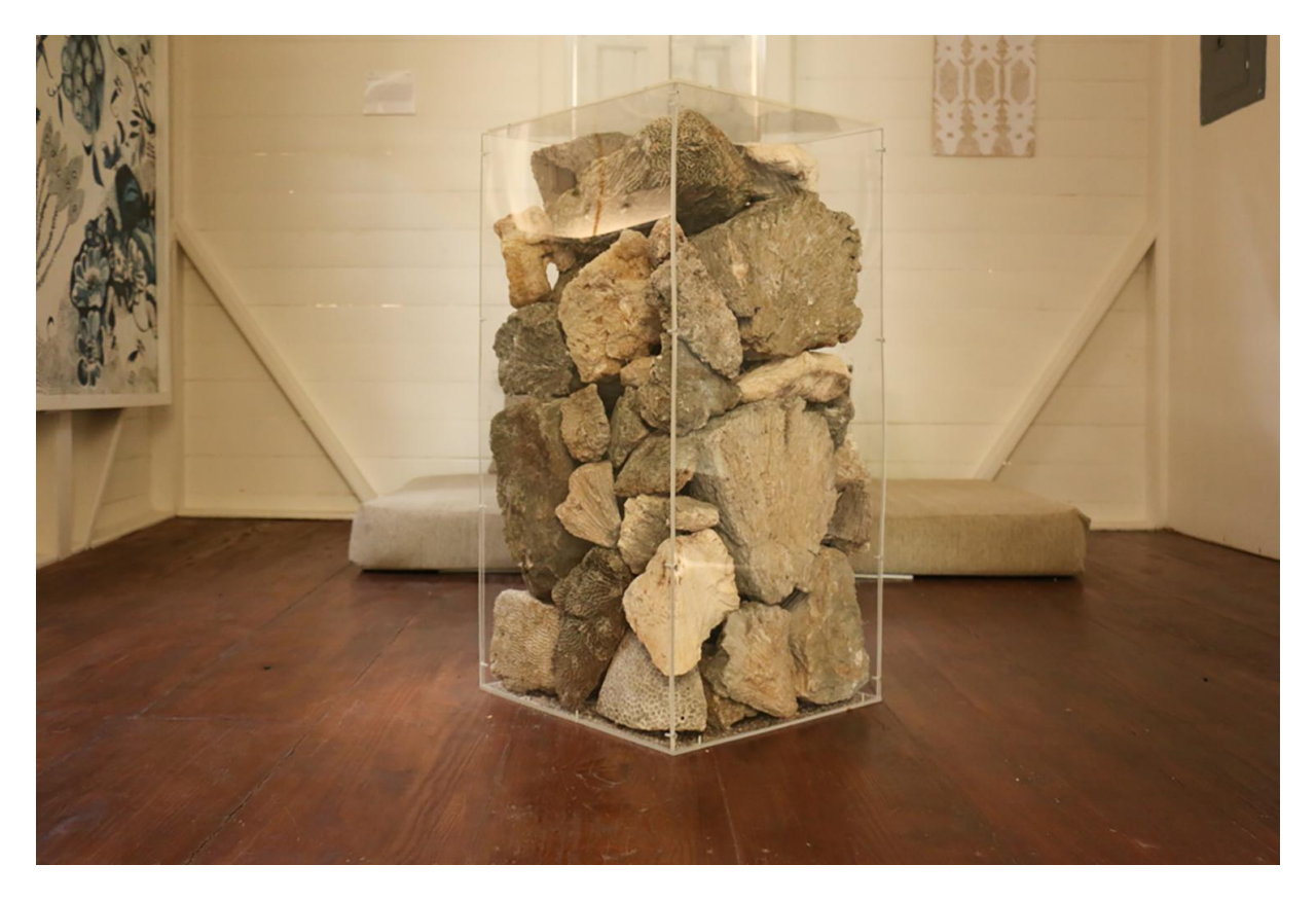
Figure 2. Trading Post, La Vaughn Belle 2015. Reclaimed coral stones cut by enslaved Africans, encased in plexiglass, 36"x18"x18"

the Danish prime minister). Other points of connection are the ways we have both used our family histories in our works to challenge the supposed objectivity of colonial histories and the different ways we have tried to deal with displacement, loss and fragmentation. Jeannette's attraction to Huey P. Newton and other icons of Blackness was often mediated in her video and photo work. It comes very much out of her Afro-Danish experience and the need to connect to Blackness both as a response to the lack of a physical black community in Denmark, and as a tool of resistance to living in a country where Danishness was defined by whiteness. That erasure of self and the violence implicit is matched in the violence of Whip It Good . Differently, on my side of the Atlantic, living in both the real and symbolic violence of colonial structures with towns named after Danish monarchs, the colonial forts masking as parks and the sugar mills scattered across the landscape like aged tombstones, I was compelled to look for the hidden narratives inscribed in these spaces and subvert their colonial power.